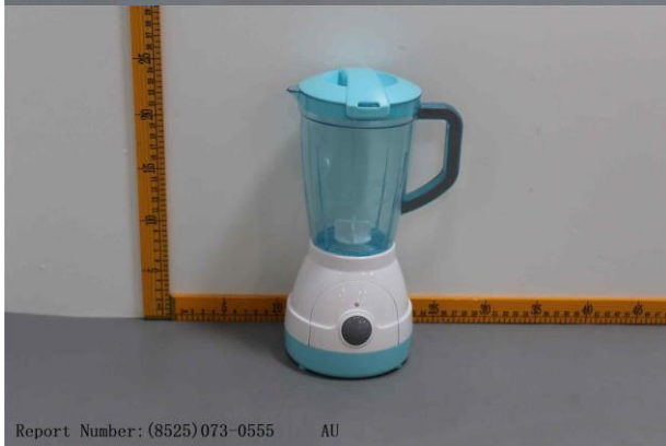
Report Number: (8525)073-0555 AU