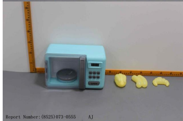
Report Number: (8525)073-0555 AJ