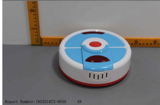
Report Number: (8525)073-0555 AN