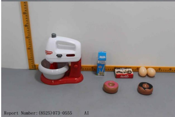
Report Number: (8525)073-0555 AI