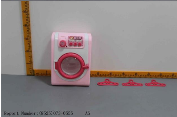
Report Number: (8525)073-0555 AS