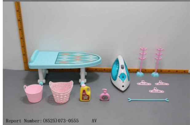
Report Number: (8525)073-0555 AV