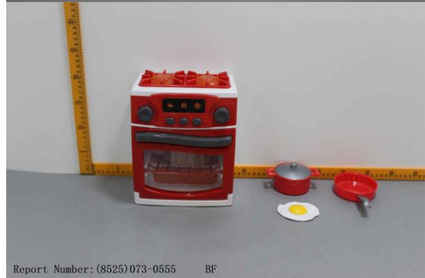
Report Number: (8525)073-0555 BF