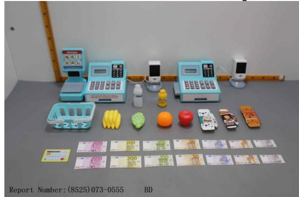
Report Number: (8525)073-0555 BD