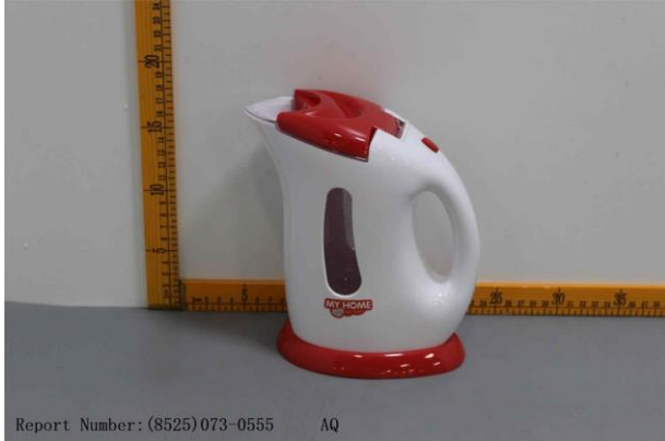
Report Number: (8525)073-0555 AQ