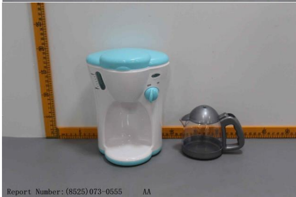
Report Number: (8525) 073-0555 AA