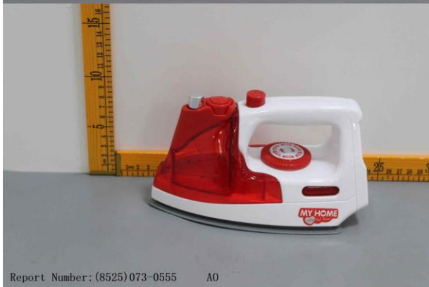
Report Number: (8525)073-0555 AO