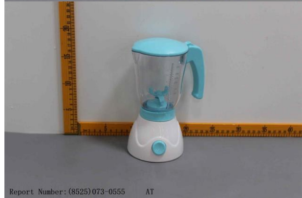
Report Number: (8525)073-0555 AT