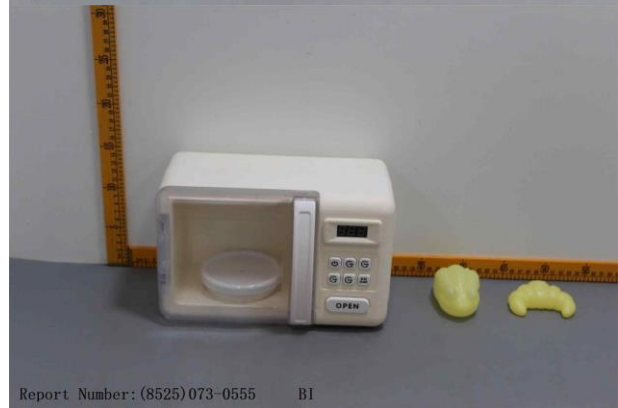
Report Number: (8525)073-0555 BI