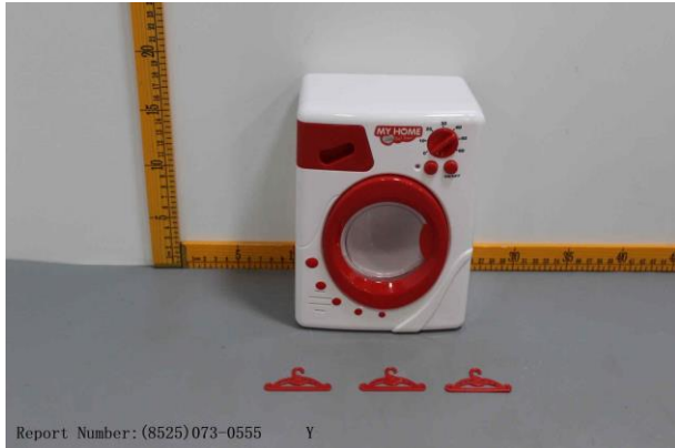
Report Number: (8525) 073-0555 Y