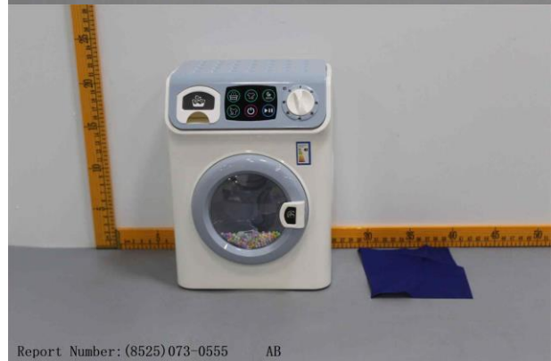
Report Number: (8525) 073-0555 AB