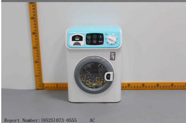
Report Number: (8525) 073-0555 AC