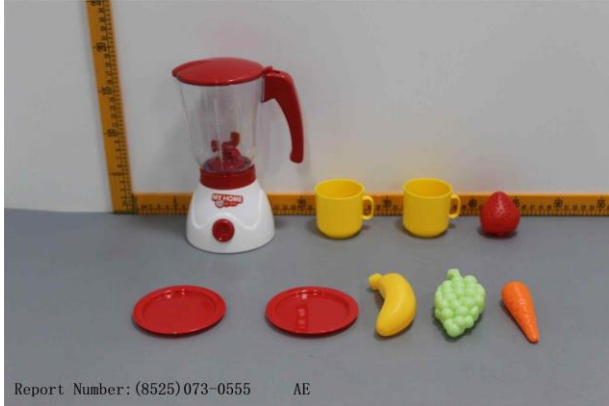
Report Number: (8525)073-0555 AE