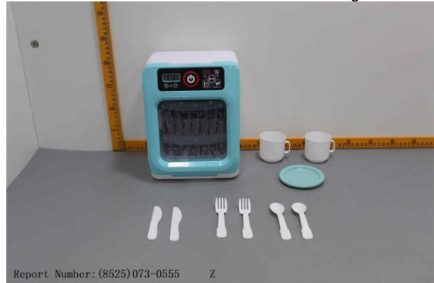
Report Number: (8525) 073-0555 Z