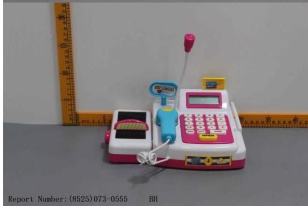
Report Number: (8525)073-0555 BH