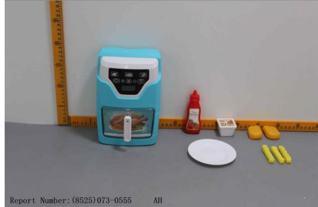
Report Number: (8525)073-0555 AH