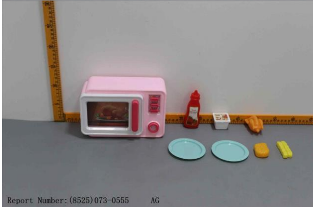
Report Number: (8525)073-0555 AG