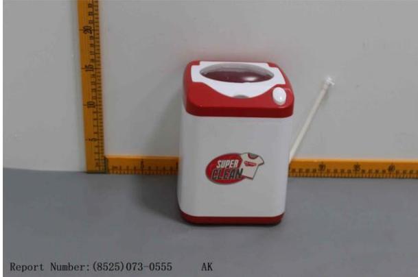
Report Number: (8525)073-0555 AK