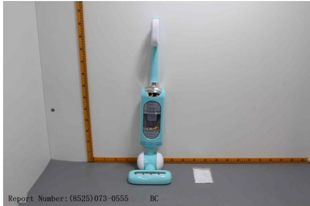
Report Number: (8525)073-0555 BC