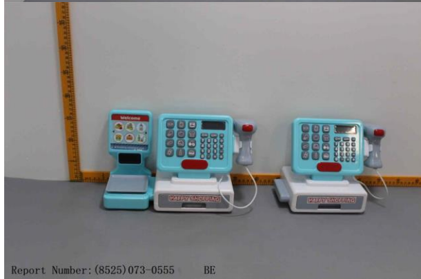
Report Number: (8525)073-0555 BE