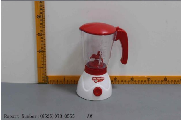
Report Number: (8525)073-0555 AM