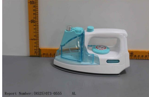
Report Number: (8525)073-0555 AL