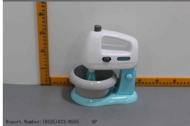
Report Number: (8525)073-0555 AP