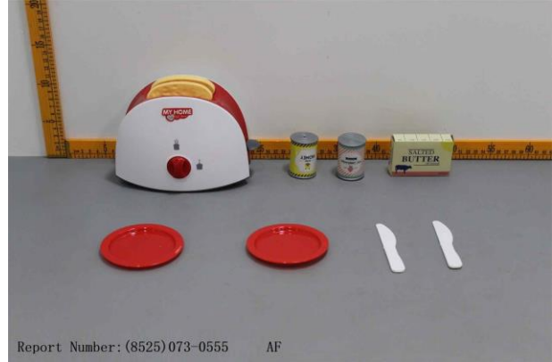
Report Number: (8525)073-0555 AF